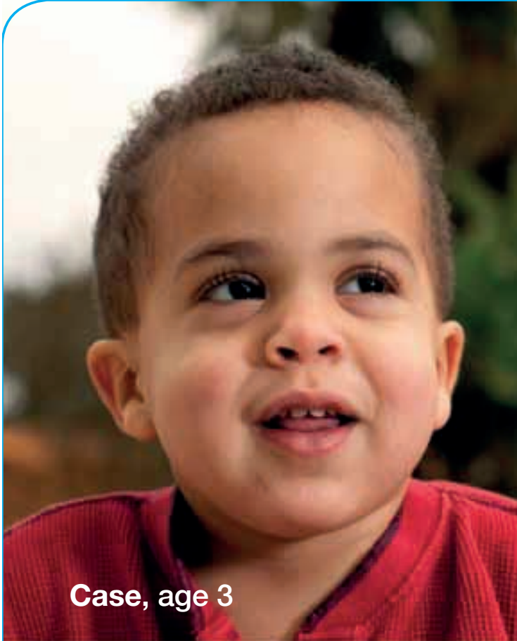
Case, age 3